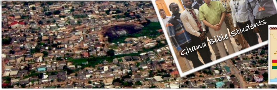
Ghana Bible Students